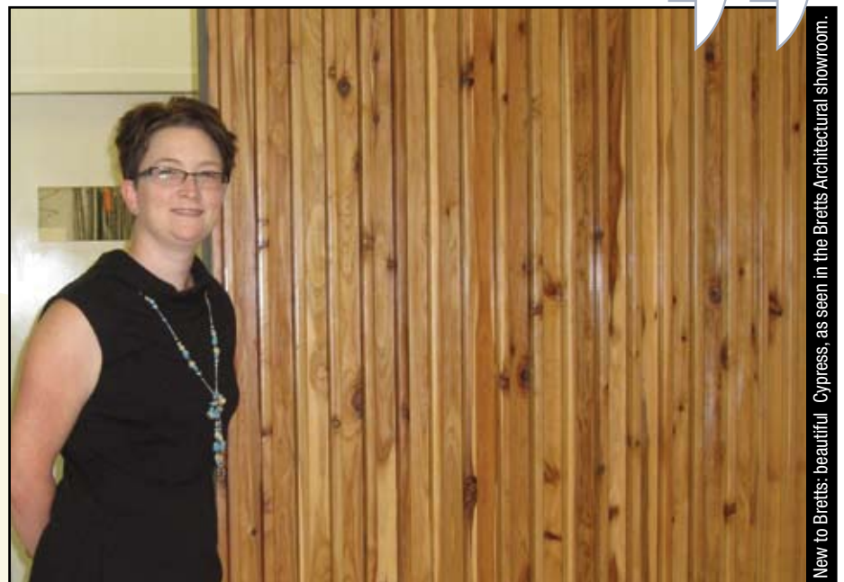
New to Bretts: beautiful Cypress, as seen in the Bretts Architectural showroom.