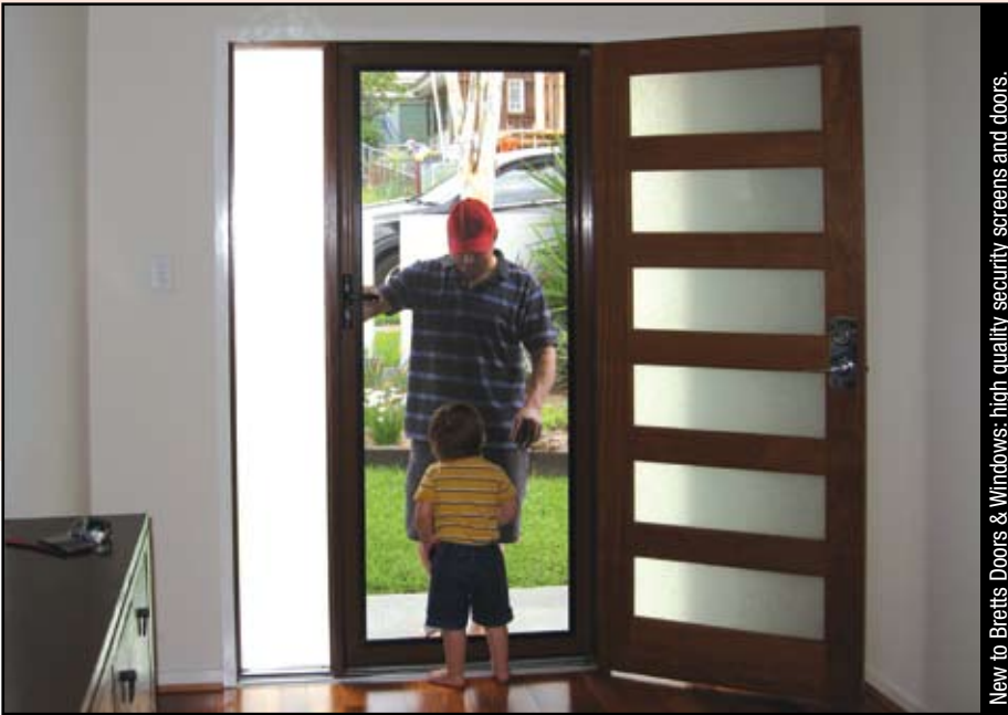
New to Bretts Doors & Windows: high quality security screens and doors.